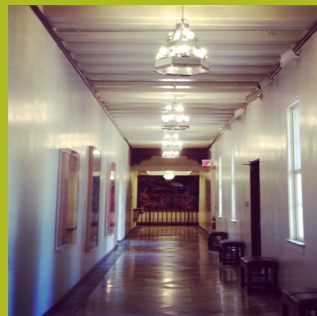
Halls of Learning